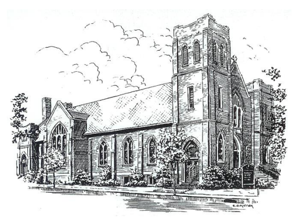
Good Shepherd Lutheran Church, New Castle